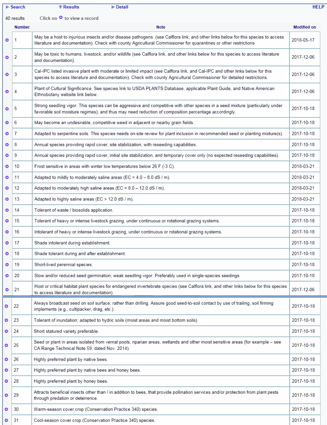
Figure 2 (continued on next page). Display of all footnotes applicable to species within the eVegGuide, sorted in numerical order, as accessed using FOOTNOTE SEARCH.